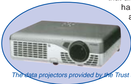
The data projectors provided by the Trust are available free of charge for community groups.

With a wide range of community organisations located in the Trust's region, several applications have been received for funding to purchase data projectors. To ensure that all community organisations benefit, the Trust has purchased three projectors, which are available on loan, free of charge. The projectors are based at the Kawerau District Council, Opotiki College Community Activities Office, and at the Disabilities Resource Centre in Whakatane.