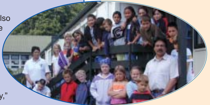
Waioatahe Valley School was one of 14 schools taking part in the energy audit pilot programme

The school audits are a new initiative for the Trust, and just one part of the huge commitment by the Trust to improving energy efficiency in the Eastern Bay of Plenty. Further pilot programmes are planned in partnership with EECA, involving energy audits on dairy farms, rest homes and motels, all high users of energy.