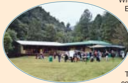
Te Urewera Education Centre

The Trust Deed, which governs the way that the Trust operates, states that funds can be applied for or towards energy-related purposes for consumers.