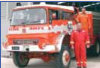
Whakatane Volunteer Rural Fire Force