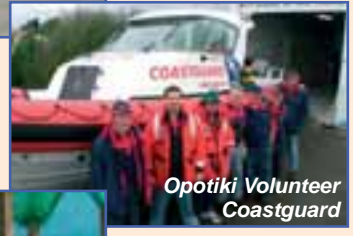
Opotiki Volunteer Coastguard