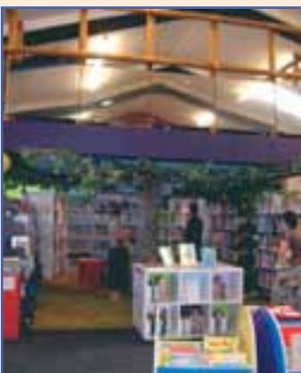
Kawerau library & museum