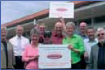
Project Hope EBOP