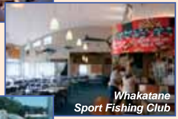
Whakatane Sport Fishing Club