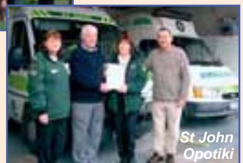
St John Opotiki