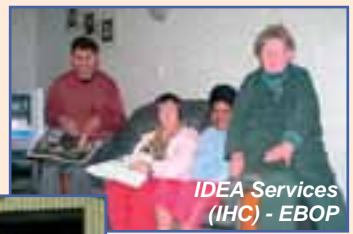
IDEA Services (IHC) - EBOP

Beneficiaries will be encouraged to complete a questionnaire, which will be available via the Trust's website. A special issue of ENERGY FLASH will be also published, containing important information about the consultation and the questionnaire.