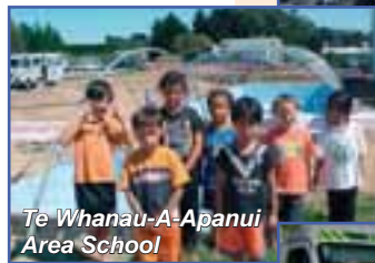
Te Whanau-A-Apanui Area School