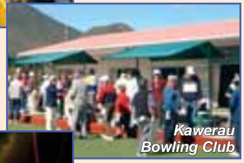
Kawerau Bowling Club