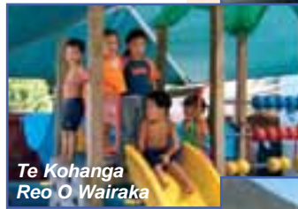
Te Kohanga Reo O Wairaka