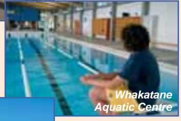
Whakatane Aquatic Centre