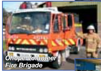
Ohope Volunteer Fire Brigade