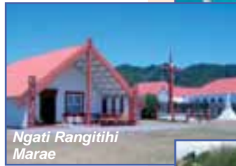
Ngati Rangitihia Marae