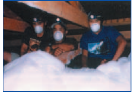
Above: The Trust's retrofit insulation programme now includes all existing houses with inadequate or no insulation.

People living in houses which may have inadequate insulation should contact Energy Options - Phone 07 308 9126.