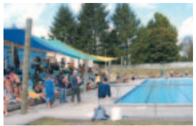
Murupara Swimming Pool

The Murupara swimming pool is a well-used, valuable community asset. EBET funding has covered the costs of installing heat pumps to warm the water thereby extending the swimming season, as well as the recent lighting upgrade and installation of coin operated hot showers.