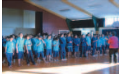
Murupara Primary School