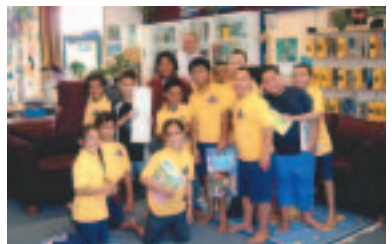
Te Kura Kaupapa Motuhake o Tawhiuau

The Eastern Bay Energy Trust has also made energy-related distributions to the Murupara Rugby & Sports Club ($20,000); Murupara Kindergarten ($13,487); St Mark's Presbyterian Church ($13,921); Galatea School ($6,765) as well as providing funding towards the costs of feasibility studies for the Galatea Community Irrigation project ($68,933).